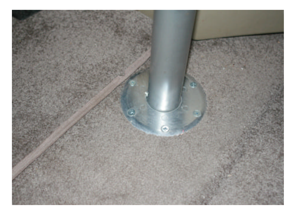
Recessed table mount just behind front seats.